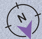
TOWER-2: 1st & 2nd Floor