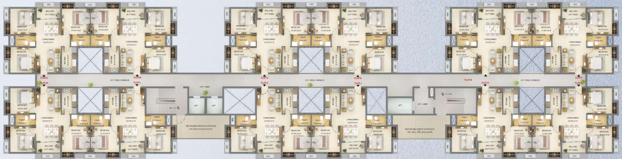
TOWER-1 : 4th - 25th Floor